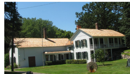
NEW roof Installed back in 2010

The Ames-Florida-Stork House is located at: 8131 Bridge St Phone (763) 477-5383 Email: storkhouse@cityofrockford.org www.storkhouse.org