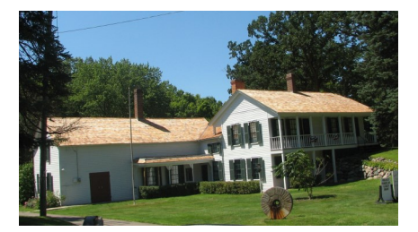
NEW roof Installed back in 2010

Tickets $29 each in advance or $35 at the door (limited amount of tickets available)